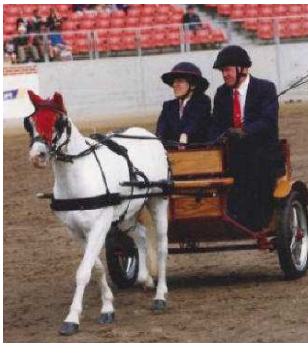
Gumnut competing at the 2000 Royal East Show